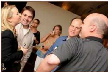
Everyone enjoyed the festivities.